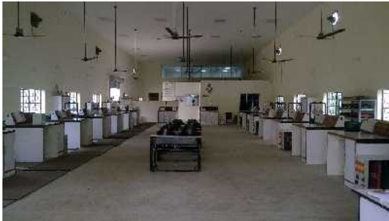
Department of Electrical and Electronics Engineering

Electrical Engineering is one of the oldest branches from time immemorial. It is one of the fundamental branches of Science and Technology on which all other branches of engineering have evolved from. Electrical and Electronics Engineering work in a variety of fields including power sector, machine design, renewable energy sector, biomedical engineering, aerospace industry, communication industry and information technology. The department of Electrical and Electronics Engineering has intake of 60 students per year. It has well established laboratories and is manned qualified and dedicated faculty.