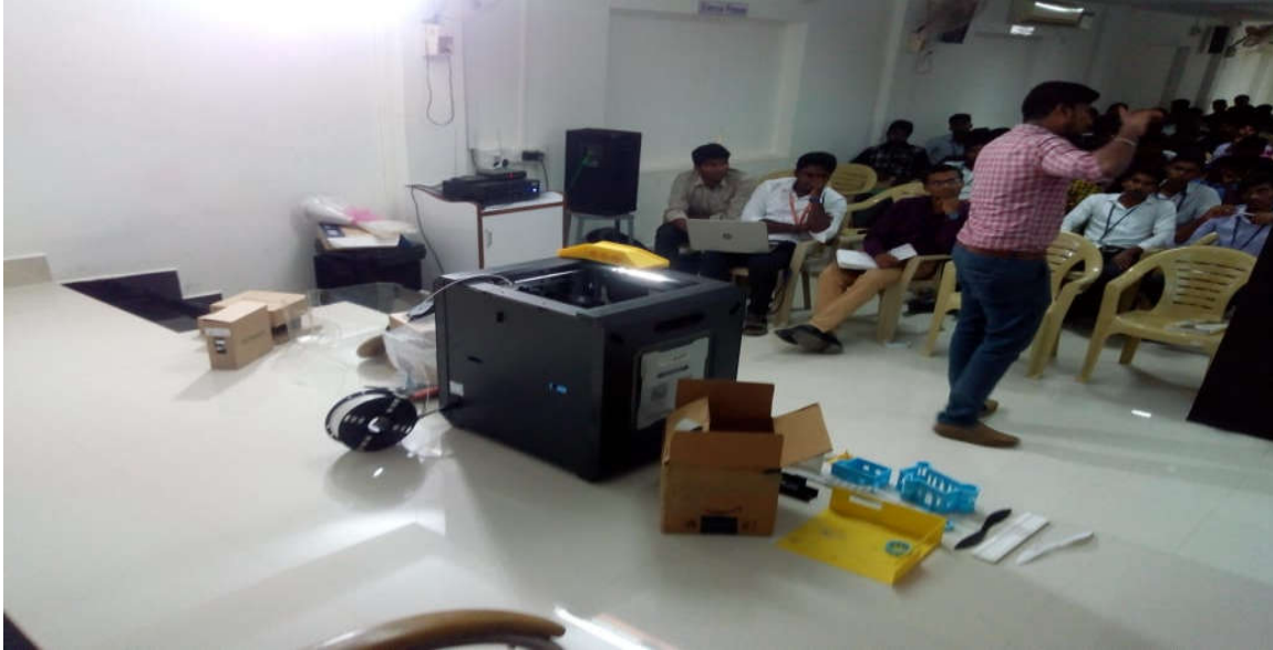
Explained practically about process of 3D printing