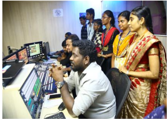
PRODUCTION CONTROL ROOM - 1