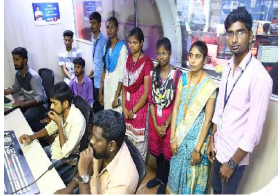
PRODUCTION CONTROL ROOM - II