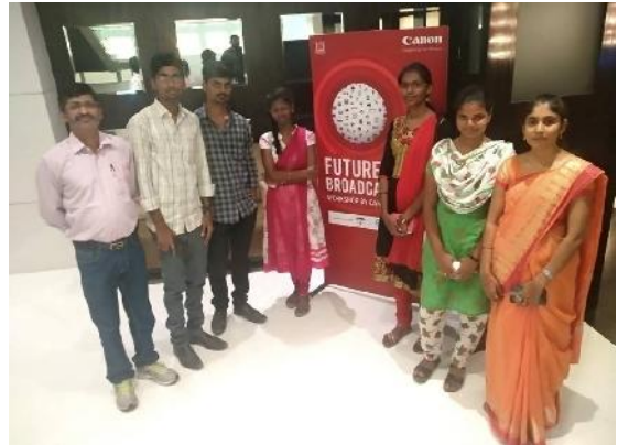
Canon Future Broadcasting Workshop held at "THE PARK Hotel"