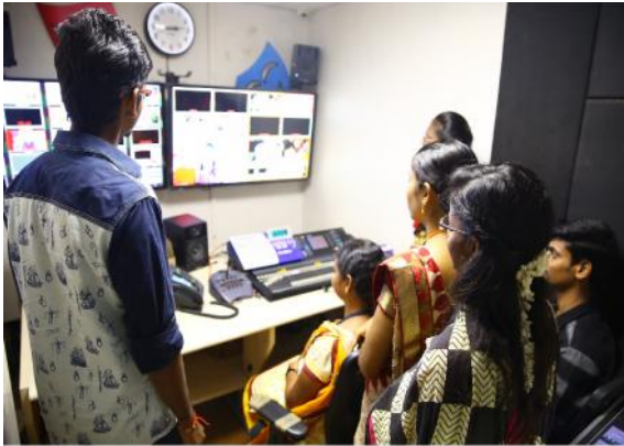
AUDIO CONTROL ROOM