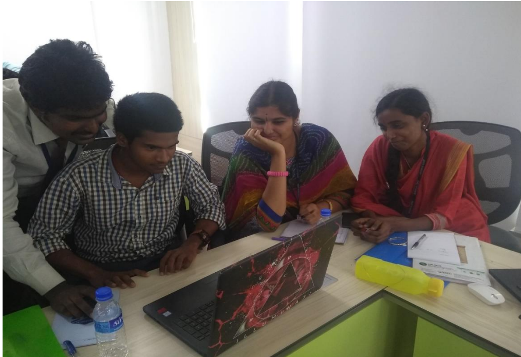
Students learning Fusion software