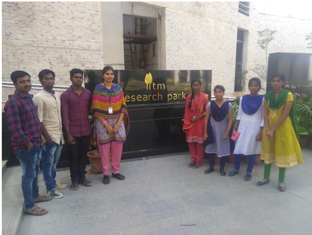
Students at IITM research park